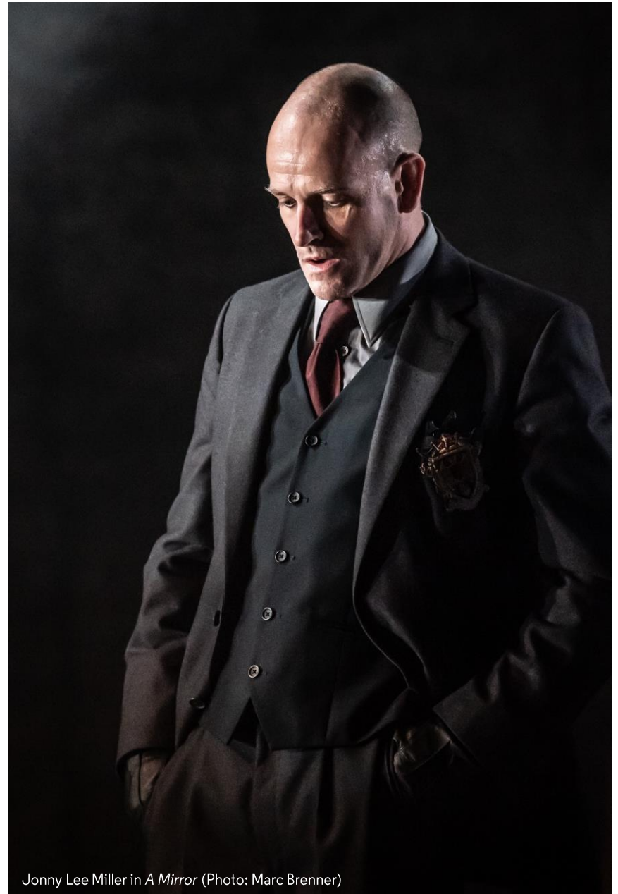
Jonny Lee Miller in A Mirror

Competitive salary dependent on experience.