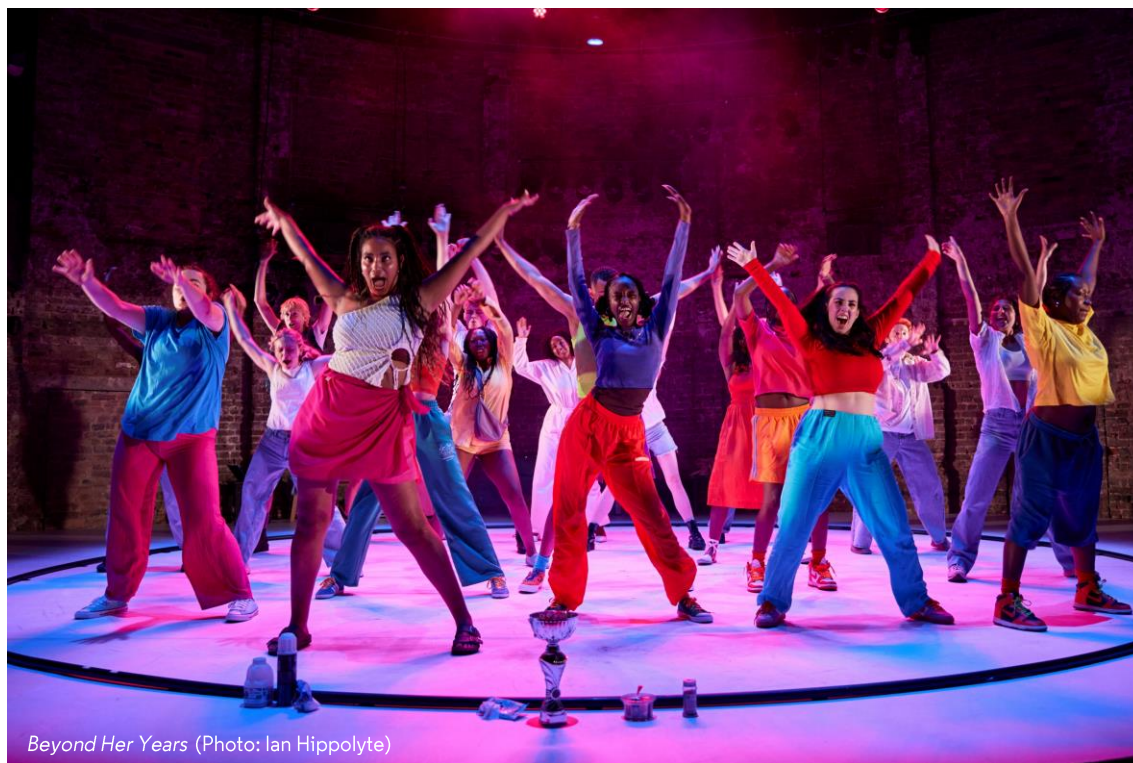
Beyond Her Years

In 2018, we set up a Youth Advisory Board, a group of young people aged 18-25 who are interested in arts leadership. They meet regularly as a group and are in dialogue with the senior management team and the Almeida Board. Currently they are focusing on data collection and how we tell stories about our participation programme; access work; and youth leadership. They continue to monitor our Actions for Change work and feed into the Board EDI Committee.