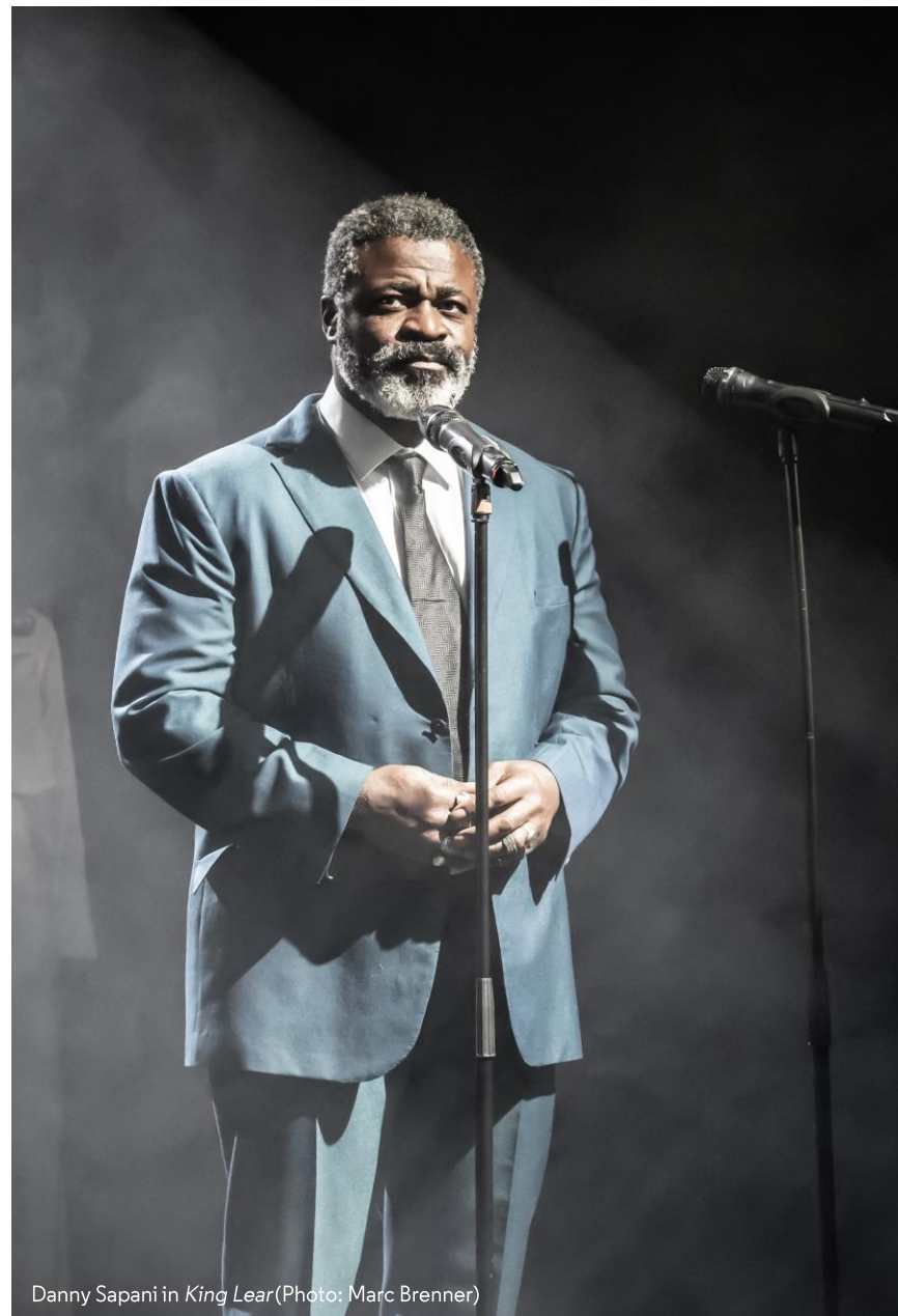
Danny Sapani in King Lear