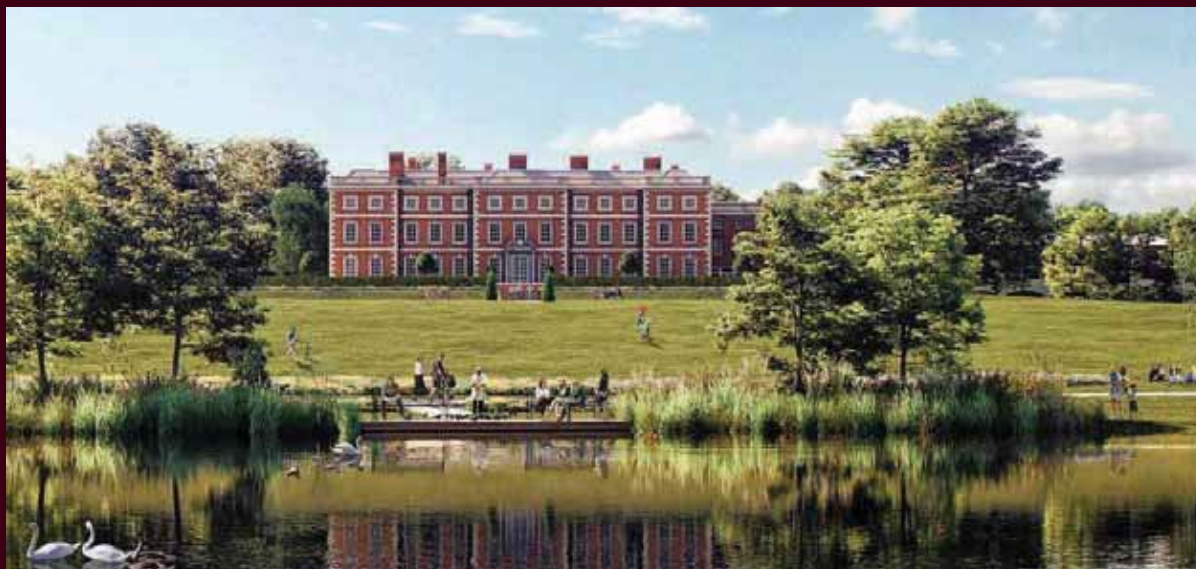
Artist impression of Trent Park House and grounds after restoration

MCA Consulting Engineers - Services design