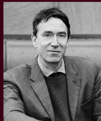
The Marquess of Cholmondeley

March 2024 Edition © 2024 Trent Park Museum Trust