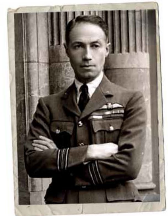
Sir Philip Sassoon (1888 – 1939) who served in WW1 and later as Under-Secretary of State for Air