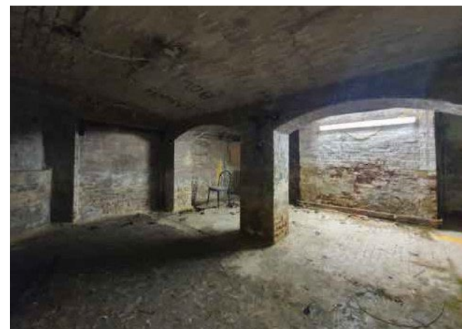
An 'M Room' in the basement used by Secret Listeners in WWII