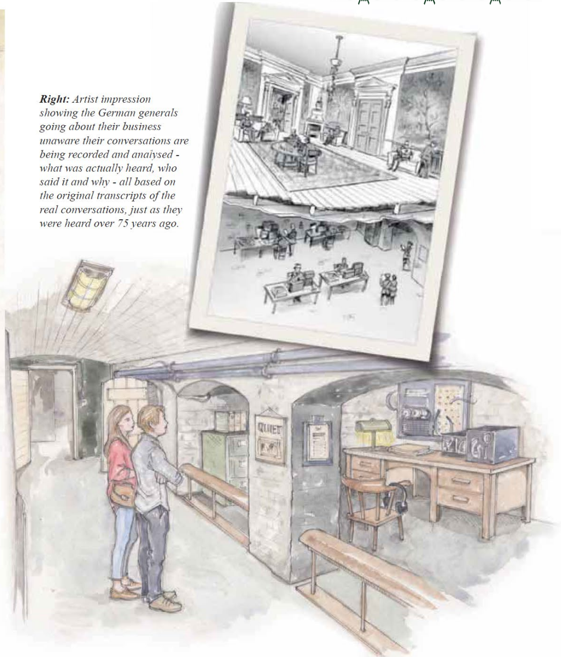
Right: Artist impression showing the German generals going about their business unaware their conversations are being recorded and analysed - what was actually heard, who said it and why - all based on the original transcripts of the real conversations, just as they were heard over 75 years ago.