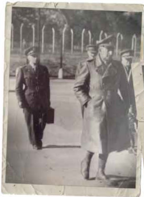
General Hans-Jürgen von Arnim arrives at Trent Park after capture in North Africa, May 1943