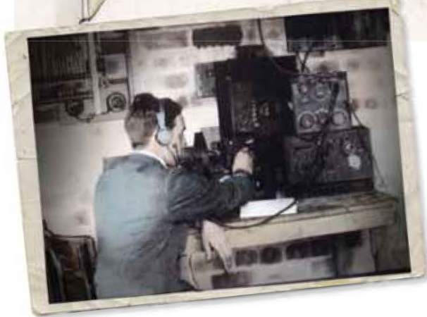
Secret Listener at the customised listening and recording apparatus