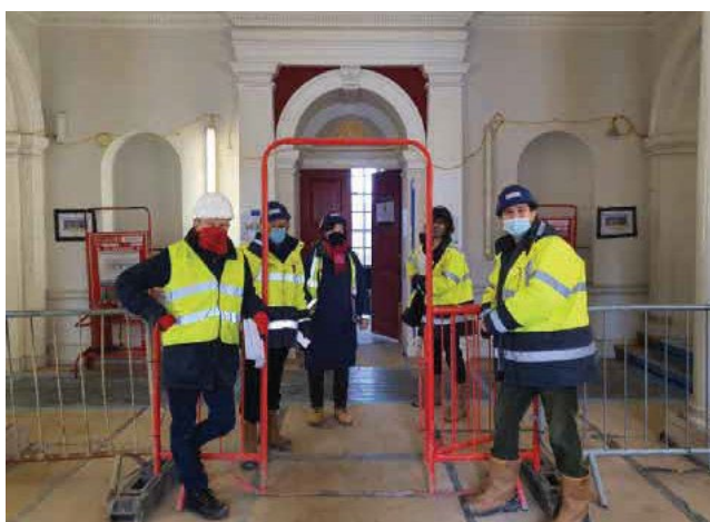
Members of the Trent Park House team in the Front Hall