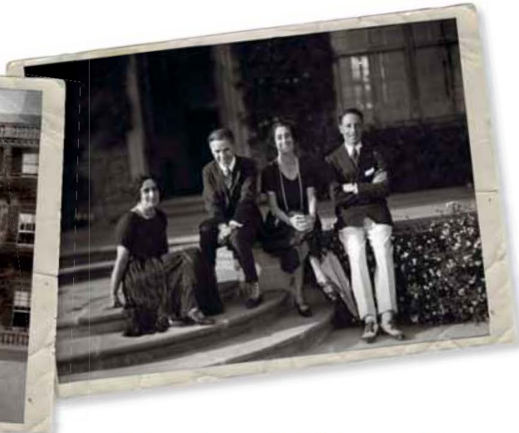
Sir Philip Sassoon with sister Sybil and Charlie Chaplin, 1921