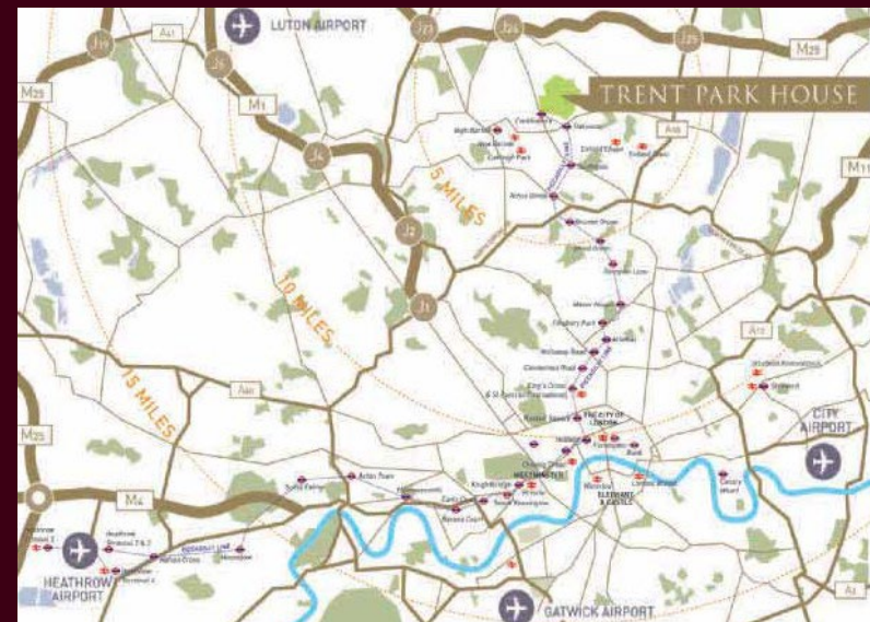
Trent Park House is 10 mins by car from the M25 and 30 mins by tube from Kings Cross