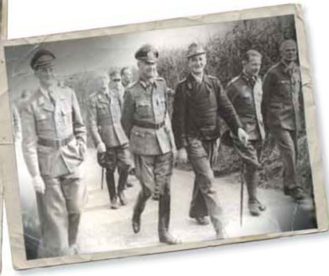
German generals walking in the grounds of Trent Park with their 'minders'