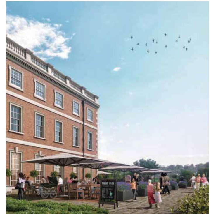
Artist impression of the Trent Park House café

Once complete, Trent Park House will become an important link, both in content and geography, between existing attractions such as the Imperial War Museum and the Churchill War Rooms to the south and Bletchley Park and Bentley Priory to the north, many of which are within an hour's journey. We will also work with local and national organisations with strong contextual links with Trent Park to highlight themes such as migration and technology. Through our learning and outreach programmes, we are committed to forming meaningful partnerships with local communities.