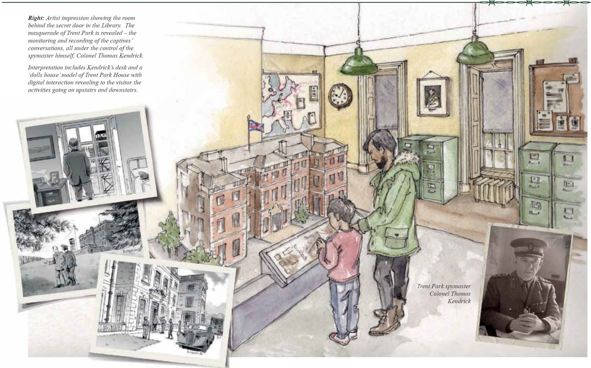
Trent Park spymaster Colonel Thomas Kendrick

Interpretation includes Kendrick's desk and a 'dolls house' model of Trent Park House with digital interaction revealing to the visitor the activities going on upstairs and downstairs.