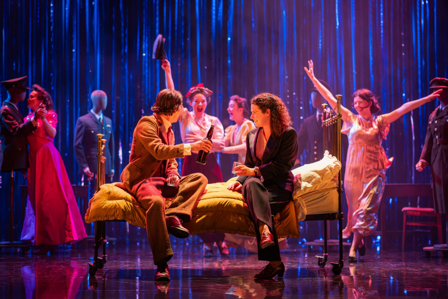
The Girls of Slender Means.