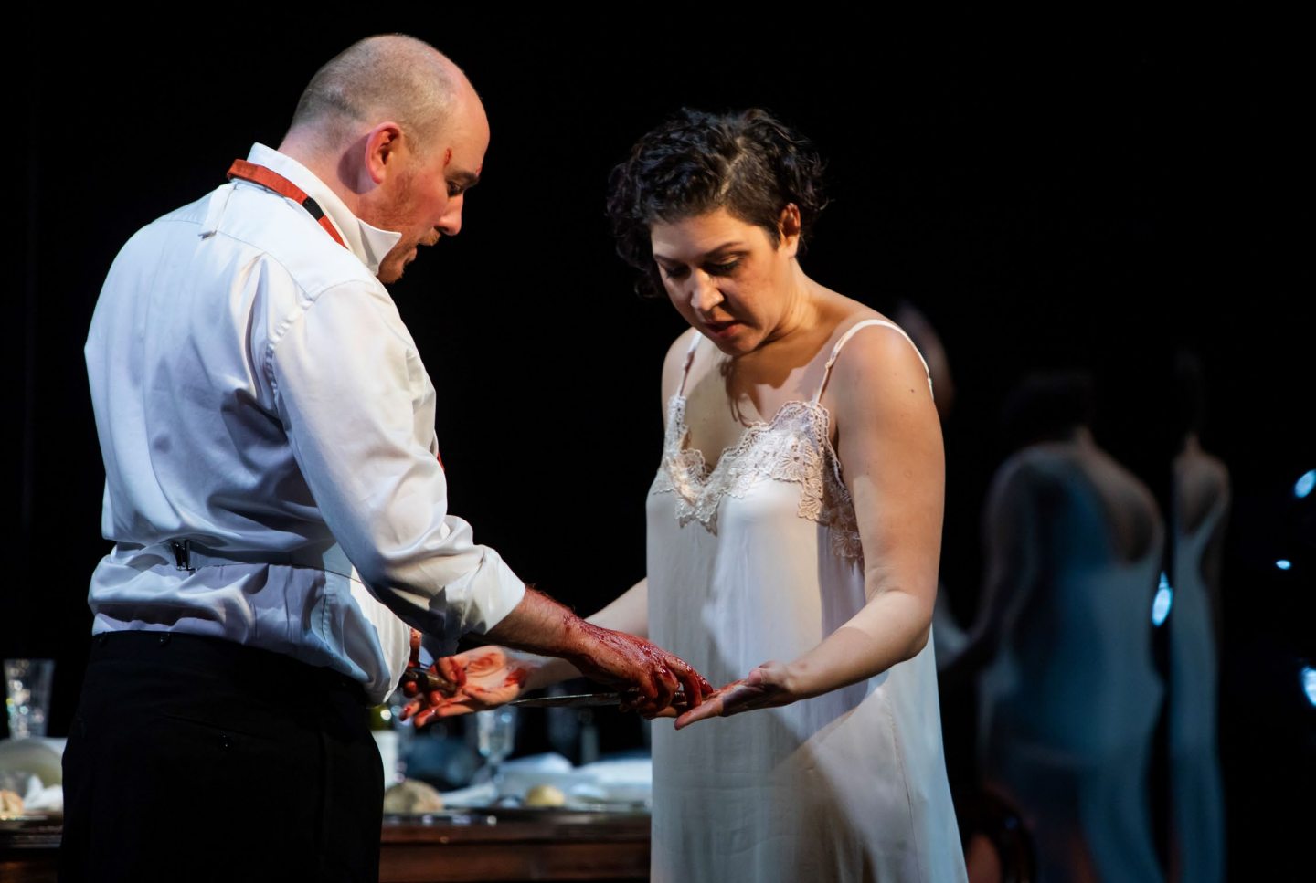
Macbeth (an undoing).