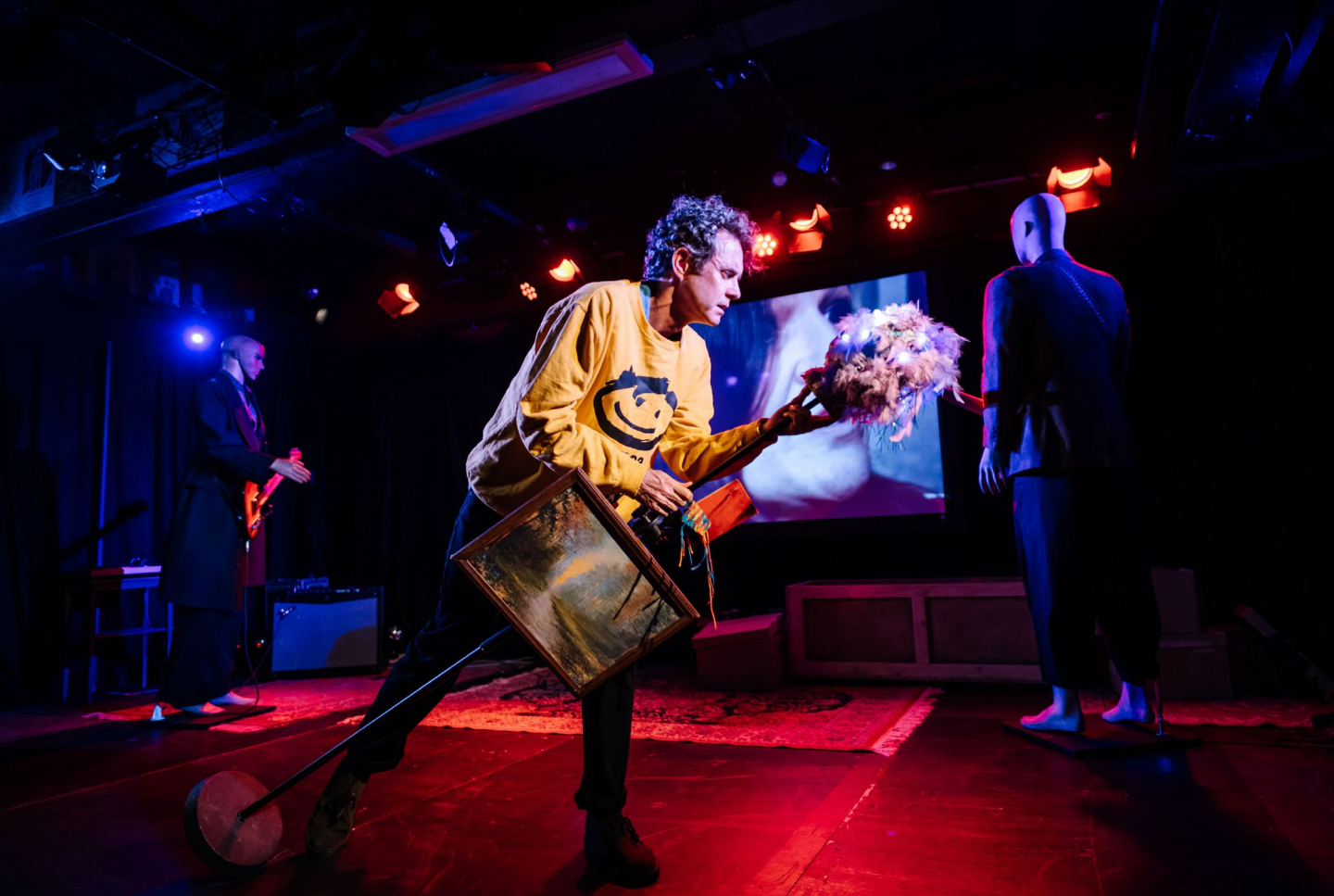
This is Memorial Device.