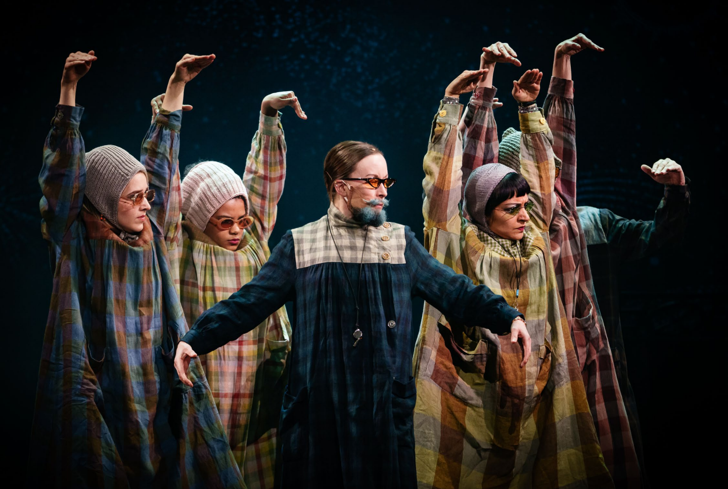
Blue Beard.