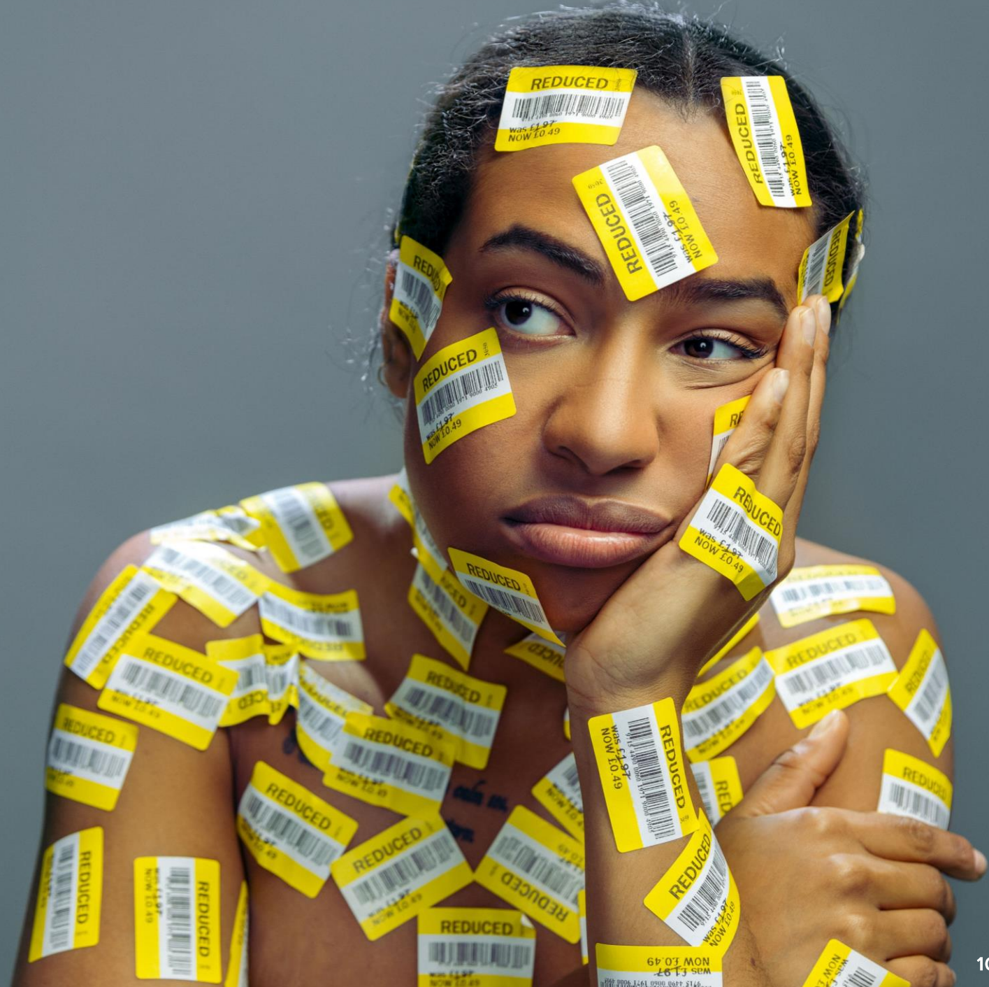
Things I Can Laugh About Now