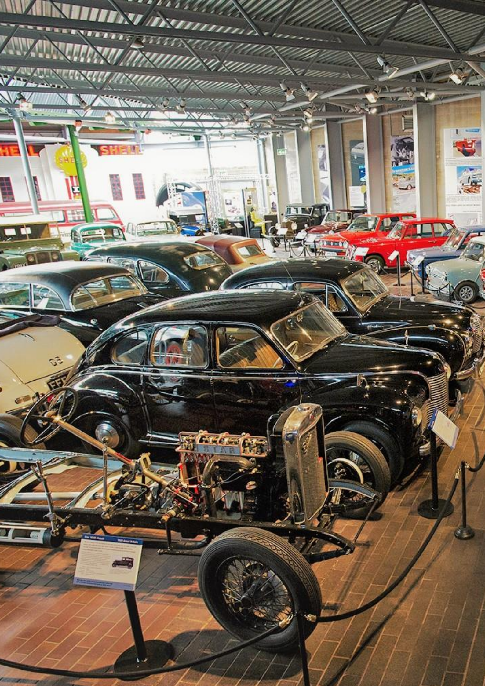
1930 Buick Model 500 Buick Model 500